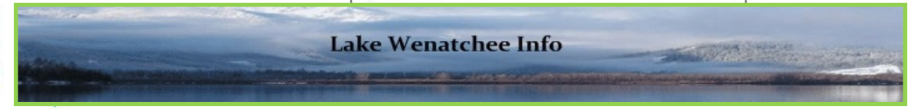
Lake Wenatchee Info