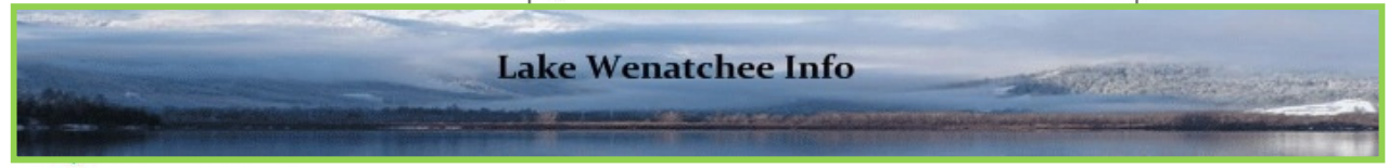
Lake Wenatchee Info

❄️ SAFETY MESSAGE ❄️ ❄️ Stay to the Right ❄️ Slow Down ❄️ Respect Other Trail Travelers ❄️ Weather Conditions Change Rapidly...Be Prepared