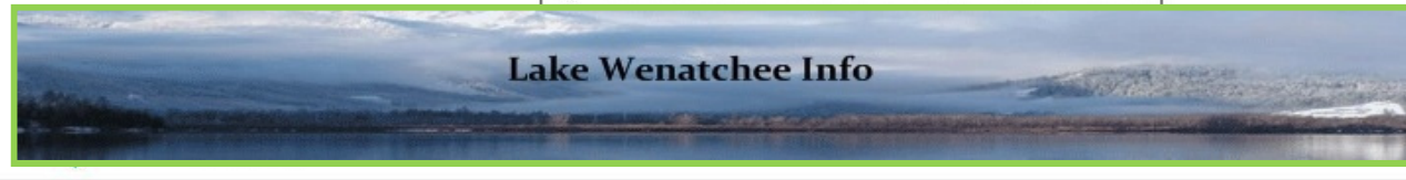
Lake Wenatchee Info