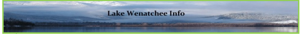
Lake Wenatchee Info

❄️ SAFETY MESSAGE ❄️ ❄️ Stay to the Right ❄️ Slow Down ❄️ Respect Other Trail Travelers ❄️ Weather Conditions Change Rapidly...Be Prepared