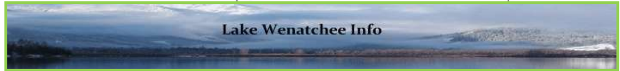
Lake Wenatchee Info